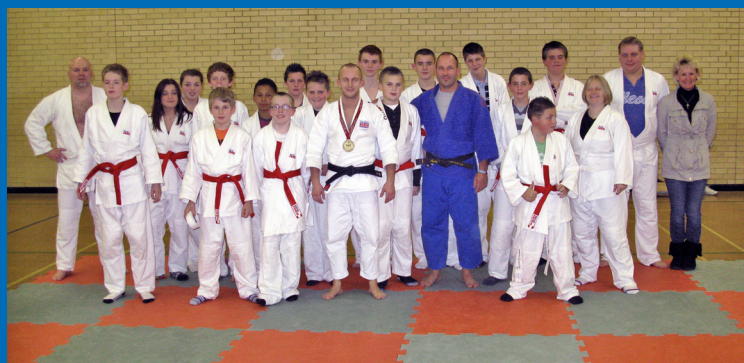
Members of the Fighting Chance Judo Inclusion Programme