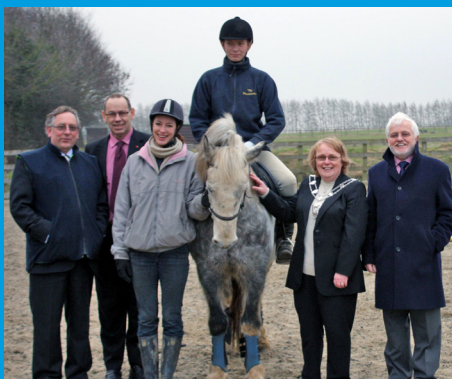
Staff from the Paddocks Riding Centre host a visit from the Sheriff of Canterbury and KPT Trustee

Thanks to grant funding from the Trust, the skilled and motivated team at The Paddocks continues to achieve remarkable results, providing therapeutic, remedial and educational activities in a safe, caring and fun environment.